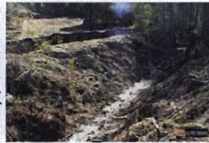
Adversely Impacted Stream

environmentally conscious manner. Stream buffers are BMPs that provide treatment for sediment, nitrogen, phosphorus, and other pollutants that might otherwise contribute to adverse water quality impacts in our streams. The absence of stream buffers can also lead to detrimental impacts on aquatic ecology and other wildlife that inhabit the stream and stream corridor. Tree canopy that provides shade and temperature control for the stream can also be impacted if buffers are not in place.