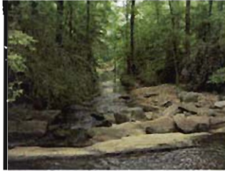
Parkersons Mill Creek—W. Longleaf

Streams can be classified into three different types based on annual flow characteristics. These three types are: