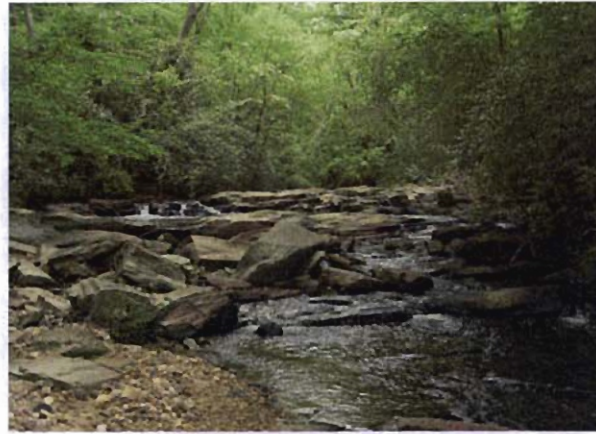
Parkersons Mill Creek, Auburn, Alabama