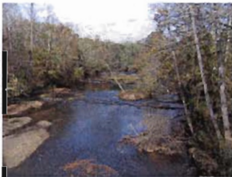
Saugahatchee Creek—Lee C. Rd. 188

Stream buffers are best management practices (BMPs) that can be implemented by developers, engineers, government agencies, etc. during the construction phase, as well as during post-construction, for the removal of pollutants and enhanced infiltration of runoff.