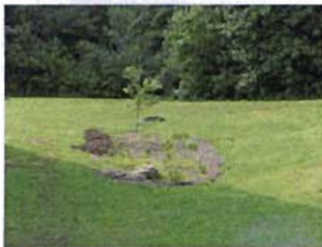
Alex City Rain Garden