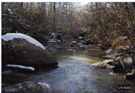
Cleaner streams provide a benefit to all.

The series is produced by the ALOA Storm Water Advisory Panel and is intended to protect, maintain, and restore the chemical, physical, and biological integrity of local waters in order to enhance the quality of life for our citizens.