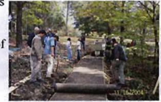
Auburn University Arboretum

Studies have shown that pervious pavement is an effective solution at removing suspended solids (80-95% removal), nutrients (70-85% removal) and metals (98% removal). Pervious pavements are ideal for driveways, walkways and parking lots but may not be effective in high traffic areas.